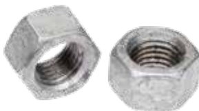
HOT DIP GALVANIZED