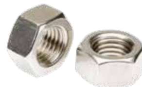
STAINLESS STEEL TYPE 18-8