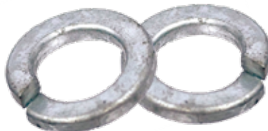
HOT DIP GALVANIZED