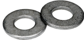
HOT DIP GALVANIZED